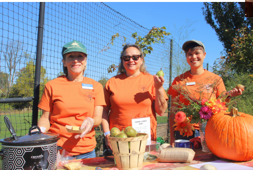
The 2nd Annual Harvest Festival welcomed 1150 visitors who sampled pear butter (above), took hayrides (right) and explored a dozen other family-friendly activities.