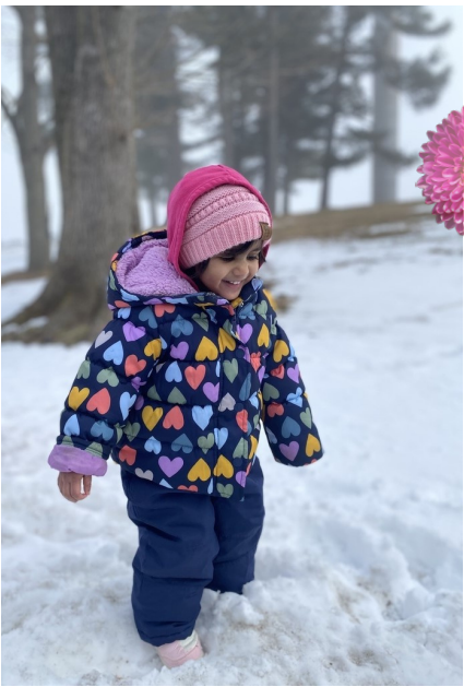
The students at Garrett's Way learned and discovered through the seasons.