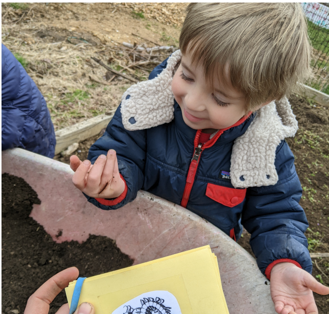
(Above) Finding decomposers in our compost pile!